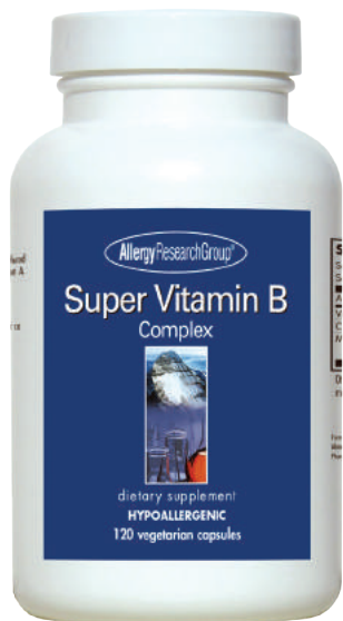
#70340 120 vegetarian capsules

Super Vitamin B Complex is an advanced and complete B-vitamin supplement, formulated especially for those who require the least amount of allergens. It provides substantial amounts of all eleven B-vitamins, including the co-enzyme forms of vitamins B2 and B6 for enhanced bioavailability, and extra pantothenic acid for adrenal support.* Instead of using vitamins derived from allergen-containing plant sources such as yeast or corn, the B vitamins in this formula are synthesized from hydrocarbons, which originate ultimately from living sources, with very low allergy potential.